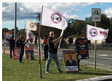
Members Rallying Port of Brisbane Road

leadership and the same political mischief used as the “trigger” for a Double Dissolution Election, and in ongoing attempts to impose the ABCC and Registered Organisation Bills if re-elected.