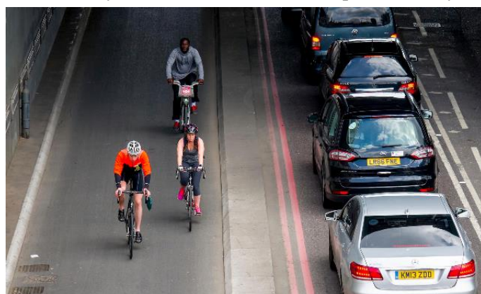
Hillman believes society has failed to challenge the supremacy of the car.

While the focus of Hillman’s thinking for the last quarter-century has been on climate change, he is best known for his work on road safety. He spotted the damaging impact of the car on the freedoms and safety of those without one – most significantly, children – decades ago. Some of his policy prescriptions have become commonplace – such as 20mph speed limits – but we’ve failed to curb the car’s crushing of children’s liberty . In 1971, 80% of British seven- and eight-year-old children went to school on their own; today it’s virtually unthinkable that a seven-year-old would walk to school without an adult. As Hillman has pointed out, we’ve removed children from danger rather than removing danger from children – and filled roads with polluting cars on school runs. He calculated that escorting children took 900m adult hours in 1990, costing the economy £20bn each year. It will be even more expensive today.