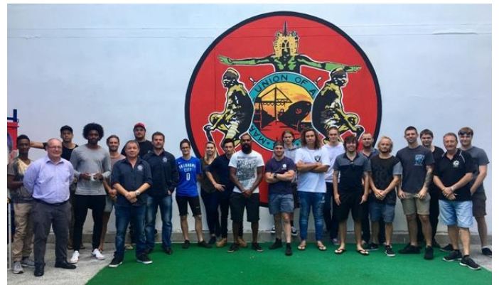
Welcome new members

feedback given, the new members thoroughly enjoyed the induction. Welcome!