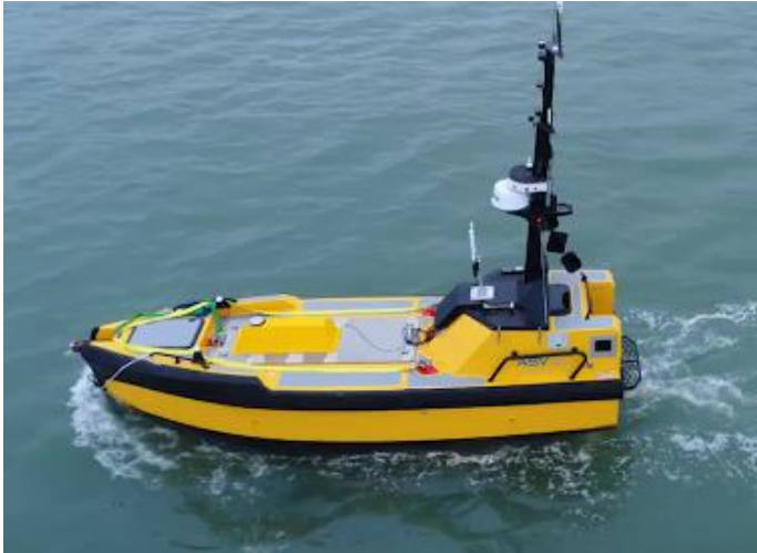
First unmanned vessel joins UK ship register

Although such autonomous vessels are now being introduced to many fleets in both commercial and military sectors across the world, they are still relatively new in the maritime sector, according to the UK Maritime and Coastguard Agency (MCA).