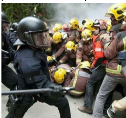
Catalunyan Firefighters defending the people in Barcelona

The IDC dockworkers refused to service the vessels that were moving 6,500 riot squad police to the region to try to suppress the referendum. The simple act of not working sent a clear message to the Spanish government that the workers will not stand by and allow the suppression of their democratic right to hold a free and open referendum for independence.