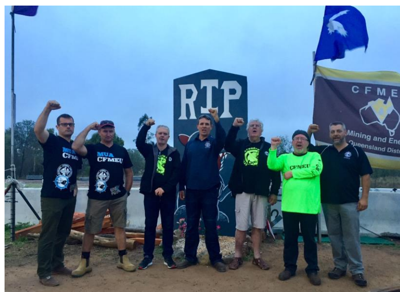
Queensland and Sydney Branch rank and file and leadership on the Oaky North picket line