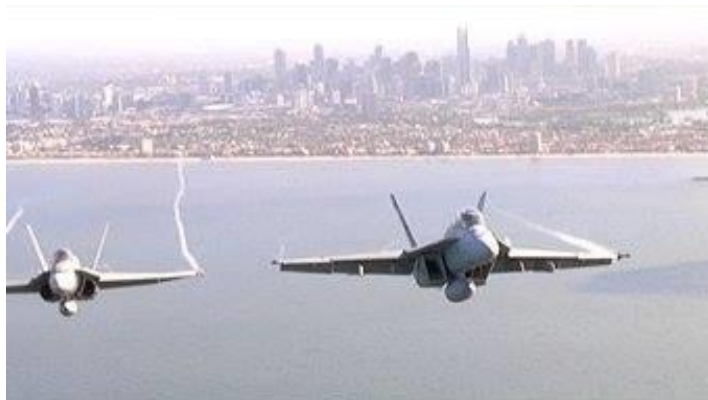
F/A-18F Super Hornets flypast Brisbane

Catalonian crowd and the fully armed police riot squad. Back at home we have our own aggressive right wing LNP government that have cut humanitarian aid to the lowest level in Australian history, and it is now seriously discussing the merits of becoming a major weapons